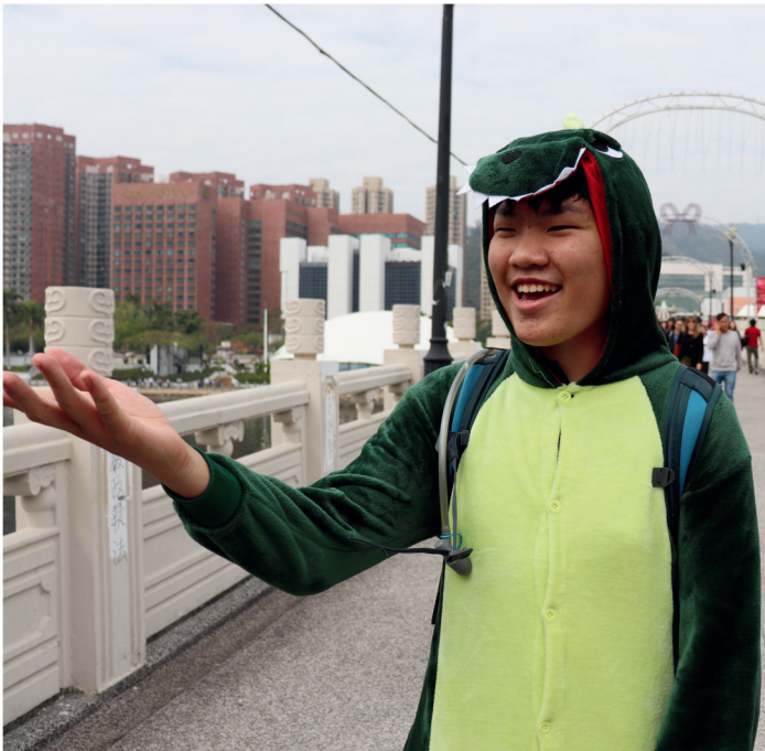
Nicola and Kenneth Bursary fundraising event.